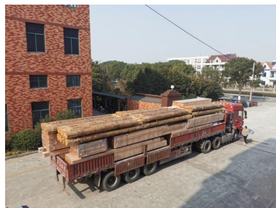
DF glulam beams and truck ready for shipping