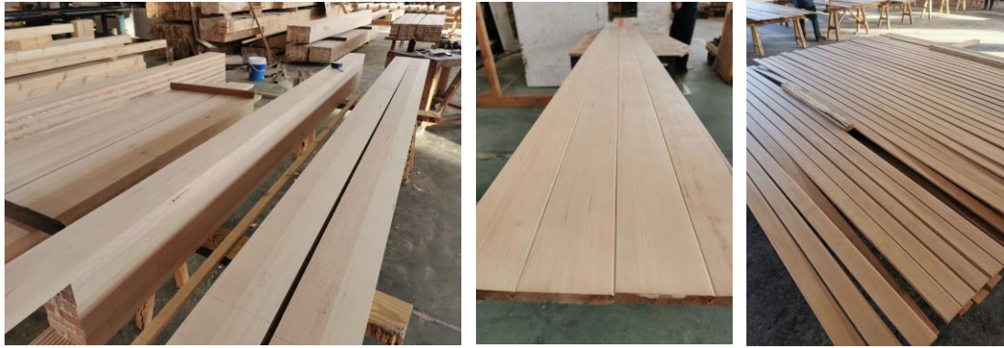
HF clear lumber used in manufacture of beams and siding